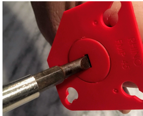
5. After the forms are stripped, use a screwdriver to remove plastic tab from FMP