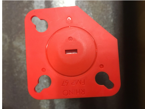
2. Verify correct FMP plate to match coupler.