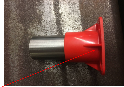
3. Insert coupler into FMP and press fit coupler fully into FMP. Coupler should be flush with FMP base