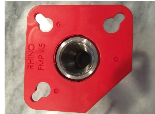
6. Visually inspect the threads to ensure that threads are clear of dirt/debris or concrete. Verify for correct male rebar. Insert and properly torque male rebar into FMP and coupler. Use RHINO SS/ST Series installation instructions for proper torque.